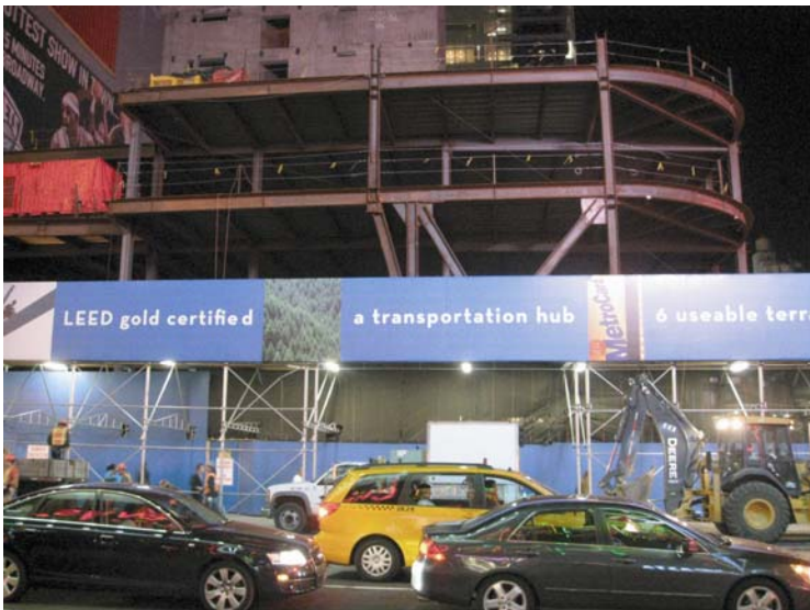
This sign is a daily reminder to every construction worker on the site that no matter how well they do their work, it will have no effect on the building’s environmentally friendly rating.

The most realistic approach would be to first award a tentative green building rating that would be subject to redaction based on actual energy use, and only issue a final rating if the utility bills show the building really is energy efficient. Of course the ratings should count measured energy use as the main criteria, not a minor portion. Rated buildings should mount award plaques with removable screws, because each year the building’s energy bills would