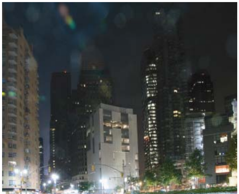
Can you guess which of these is a green building? See page 7 (Columbus Circle, New York City, 2AM on 28 July, 2008)

The LEED system has changed the market for environmentally friendly buildings in the US, but there is an enormous problem: the best data available shows that on average, they use more energy than comparable buildings. What has been created is the image of energy efficient buildings, but not actual energy efficiency.