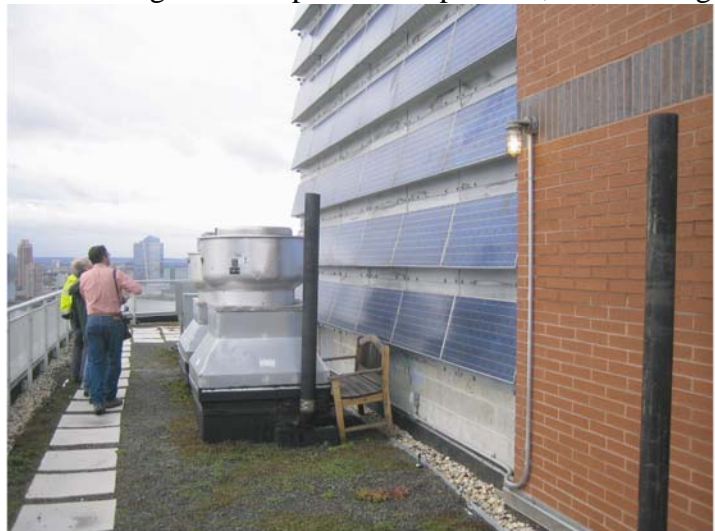
These solar panels would produce much more electricity if they were angled toward the sun, and were not shaded by rooftop equipment. As installed, they represent a colossal waste of perfectly good solar panels.

The choice to not install the panels on angled brackets on the roof, where they would produce more electricity but would not be visible from the street, made the installation a colossal waste of perfectly good solar panels. Despite this, the building